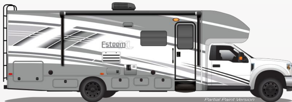
Standard Partial Paint